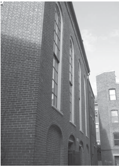
Electrical work at the museum required integrating electrical service from the new adjoined building into the historic structure.

GC: Shawmut Design and Construction, Boston, MA; EE: Plus Group Consulting PLLC, New York, NY